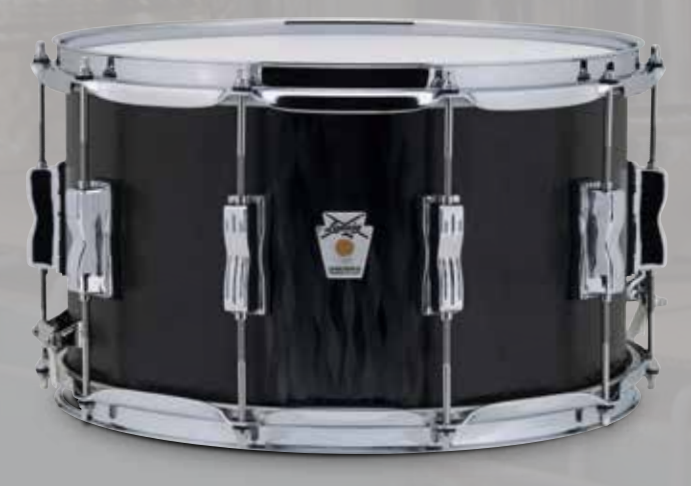
LKS784XXBF - Limited Edition 8X14" Standard Maple Snare Drum, Black Flame finish

Ludwig's new Standard Maple snare series offers an admirable combination of rich pure sound and durability, but at an affordable price. Made in the Ludwig factory in Monroe NC, this series can't be beat when it comes to price and uncompromised value. Standard Maple snares use seven plies of maple plus an attractive outer wrap or veneer combined with bowtie lugs and triple flange hoops for a great look and sound.