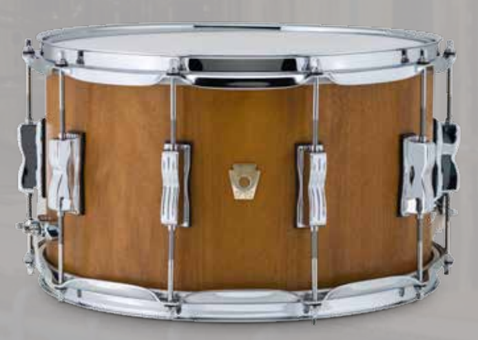
LKS784XXCH - Limited Edition 8X14" Standard Maple Snare Drum, Moiave Cherry finish