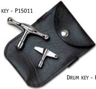
DRUM KEY - P41