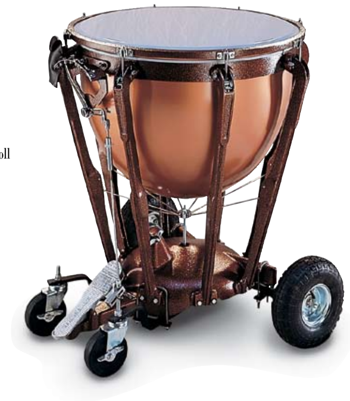
M8007 Timpani Cart Tote System with Pneumatic Wheels. Fits any size Ludwig Timpani except Machine and Universal models.