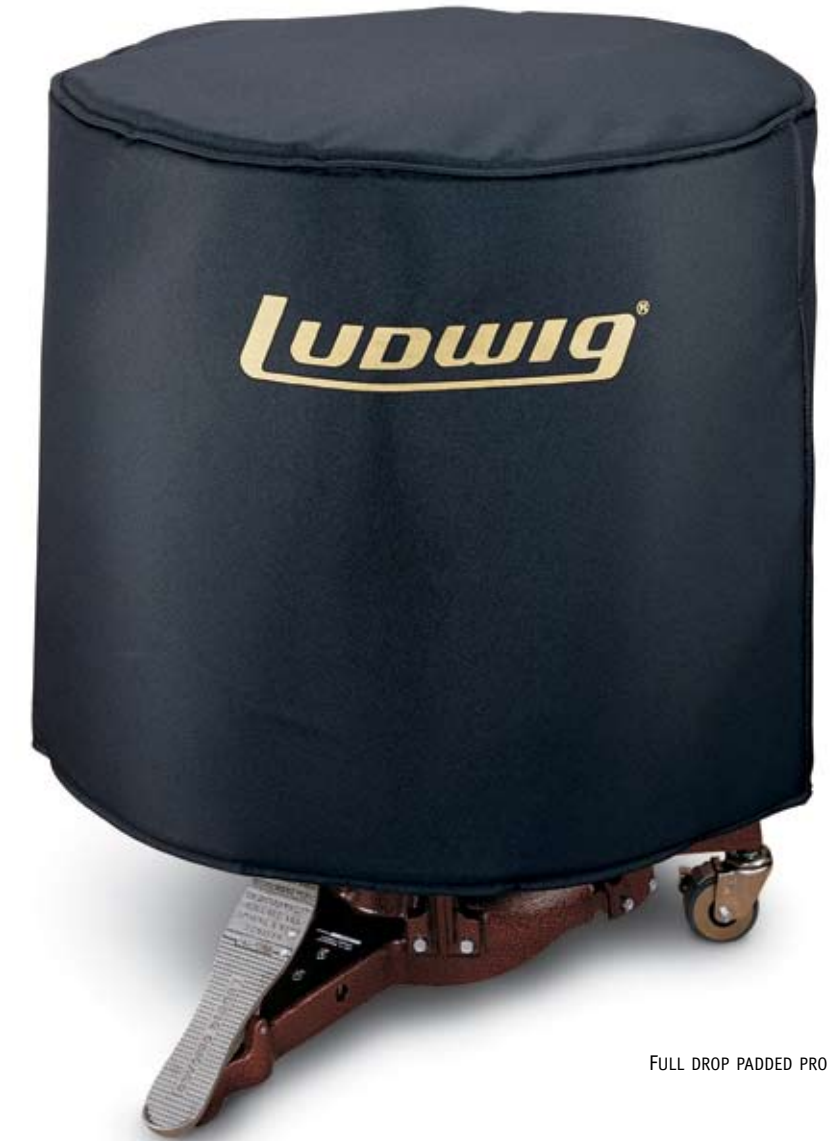
FULL DROP PADDED PRO COVERS.