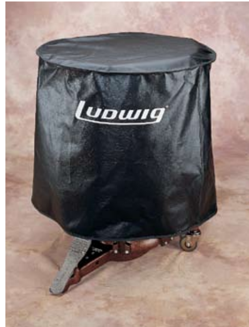
FULL DROP LIGHT DUST COVERS.