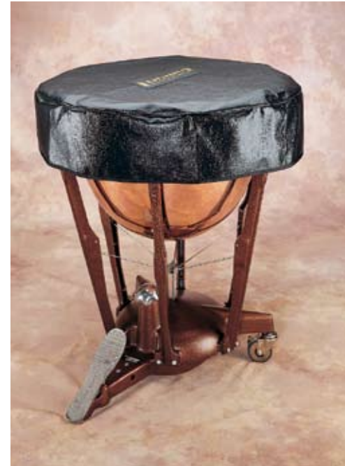
SHALLOW DROP LINED DUST COVERS.