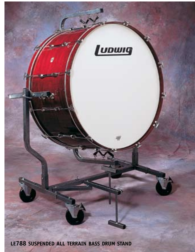
LE788 SUSPENDED ALL TERRAIN BASS DRUM STAND

ADJUSTABLE FOOT REST FOR PROPER MUFFLING TECHNIQUE. STRONG POLY STRAPS SUSPEND THE DRUM FOR MAXIMUM RESONANCE.